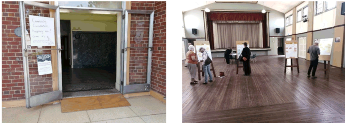
Figure 2 Drop-in session

This section includes information gathered both from hard copy feedback forms as well as 'post it notes' stuck to ideas boards.