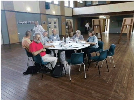
Figure 3 Ideas workshop

This section includes information gathered from small group ‘ideas sessions’ based on facilitated conversations with participants.