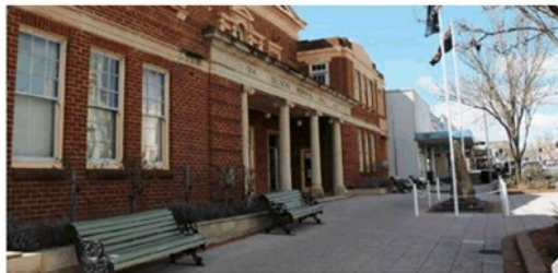
Yass Memorial Hall

Local News History Property Investigations National World