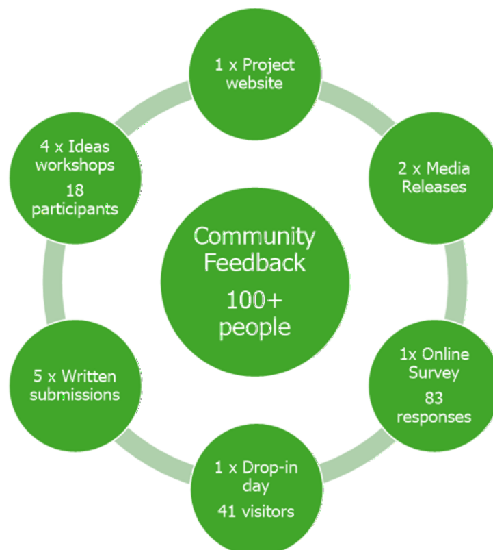
Figure 1 Engagement activities summary

In total, consultation activities produced valuable feedback from more than 100 key stakeholders, collected using a wide variety of engagement methods, outlined in Figure 1: