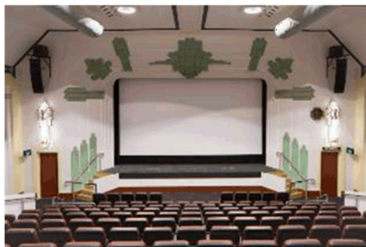
Figure 4 Goondiwindi theatre and Cowra art gallery